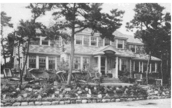
The "Edgewood" on Old Wharf Road