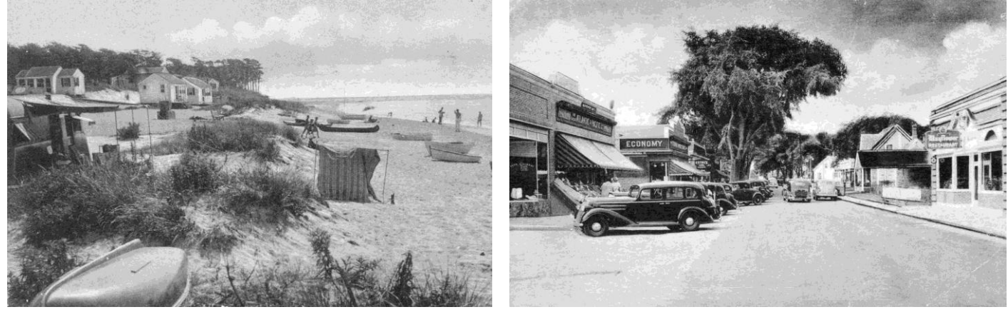
Grindell's Beach in Dennis Port