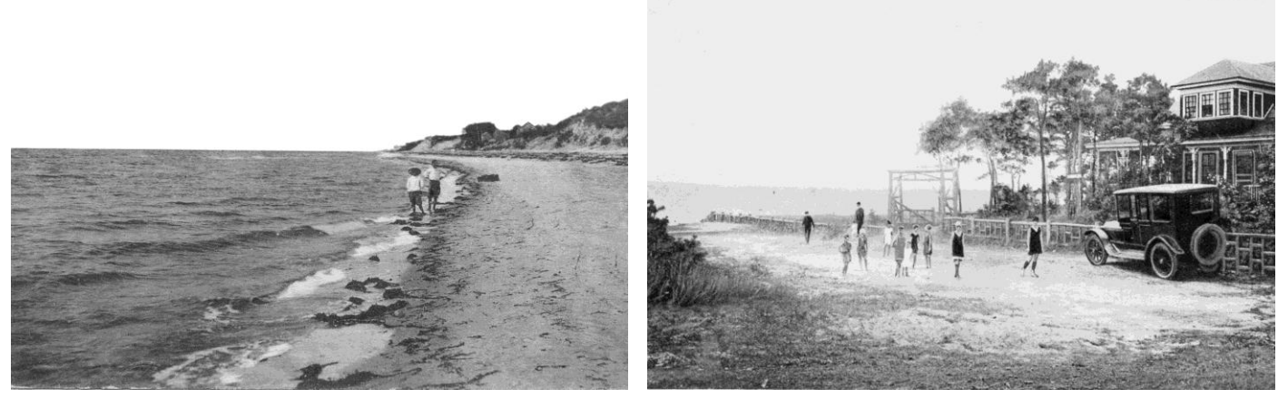
The Beach in Dennis Port