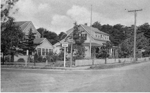
Corner of Depot Street & Old Wharf Road