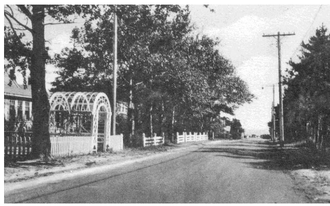
Depot Street, Dennis Port, looking toward Nantucket Sound

Of all the villages in Dennis, probably none has altered more in the past 100 years than Dennis Port. So it was both refreshing and a bit amazing to see that a resort property could not just survive, but still be recognizable a century later. A little background – It started with an email last August from one of our members who wrote - Our family has a home in Dennis Port off of Old Wharf Road. I've heard many stories of the homes that dotted the shore from the Belmont west that are now mostly motels and condos. I'm curious if the historical society has information/images of some of those homes? In response, I sent him some photos from the Digital Archive.