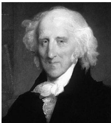
James Freeman, portrait by Gilbert Stuart

The wharf of the Nobscusset Point Pier Corporation was the center of business in Dennis village, being home to a fishing fleet, which by 1829 was comprised of seventeen schooners and seven sloops. What came before the Nobscusset Point Pier Corporation wharf?