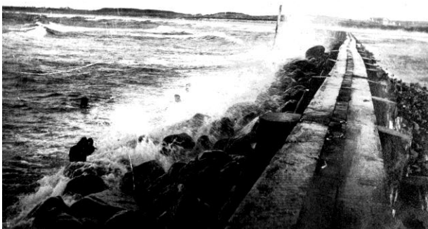
Corporation Harbor Breakwater

The quay where the fishing fleet wintered is today filled with tall, coarse hay. Where thousands of barrels were tiered, the rank beach grass grows to the knees, and where the fish cargoes were landed, three or four fishing boats and as many more dories now ride, whose aggregate size combined could not exceed fifteen tons.