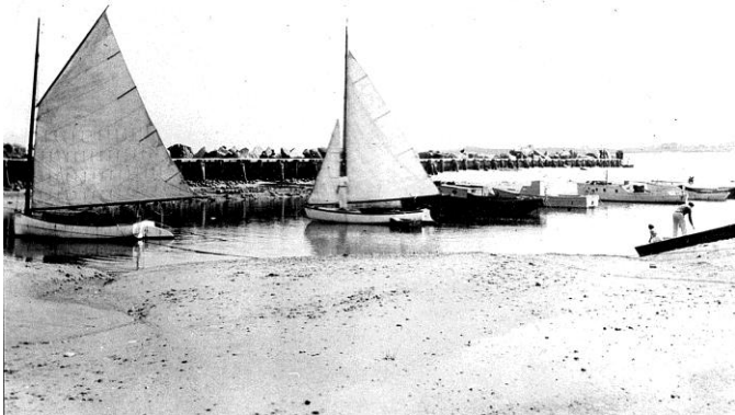
Low tide at Corporation Harbor

[Nobsusset Point – the point of land which projects slightly into Cape Cod Bay, just west of Corporation Road. Originally this was a prominent clay bluff which sat well above the water and was the lookout point in colonial times for the shore whaling industry. The point also offered some degree of protection from westerlies for vessels landing at Corporation wharf] Reminiscences of Corporation Wharf – 1875.