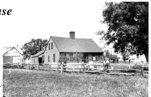
Print from a glass plate negative