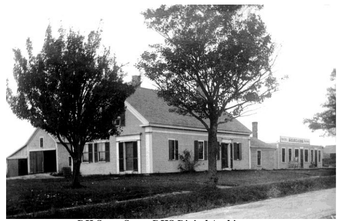
DH Sears Store

Then a short walk to DH's for ice cream, filled cookies or lemon meringue pie. And the never to be forgotten slam of the screen door at the store. Why don't other screen doors sound the same? (Can you hear it?) Then, I start back from the store, and the sun is over and above Edmond's house. It's warm and quiet, and I say to myself, why can't this go on forever? Then there is the dampness in the air which comes at sundown and the smell of ocean, the marshes and the fields all blended together. The sound again of the cars speeding on the main road, and as I look to the south over the Punkhorn Hills, I see the fog gathering and gradually coming in. And then the mornings, when the birds are singing their heads off in the trees, the sun shining through the trees over and