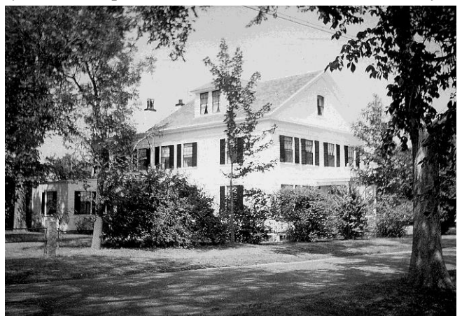
Journey's End, 32 Center Street, East Dennis

and a car being rolled out to sun. Familiar voices in the yard and while in the yard on the sunny side, the sound of the flushing of the toilet in the upstairs bathroom (Can you hear it?) Then the beach, the sand, the jetty, the flats, the wood ticks, the barnacles, the clams, the mackerel, the sea itself, and the sun which burns the fair and tans the dark. Then too, there are the people of East Dennis who can never be forgotten. All the days are not fair, and there are those that are rainy, drizzly; there are northeast storms, only too familiar to us all, which blend into a place we call Cape Cod, a place we can't forget, a place I long to return to – may it never change. I don't know what it is, but although much of my time was spent at Orleans, I don't have the same feeling for Orleans as I have for East Dennis.