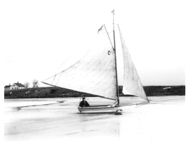
Ice boating on Scargo Lake

An early mention of hockey being played on Cape Cod included the following in the December 27, 1890 Register, from an article titled "Skating Skating on Scargo Lake, February 4, 1945 by Moonlight," which referenced activities in Yarmouth upon a Saturday evening DHS Digital Archive beneath the glow of a full moon, including: "... a full complement of young men, who, with skates and hockeys, were enjoying the invigorating sport of skating, on Long pond." The January 7, 1893 issue of the same newspaper referred to "many enjoyable skating parties" and "many hot games of hockey" being played on Dennis Pond in Yarmouth.