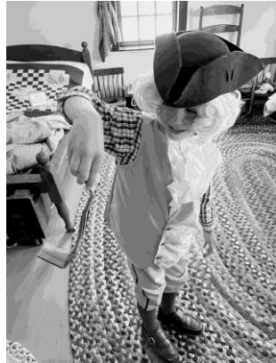
In the Children's Room